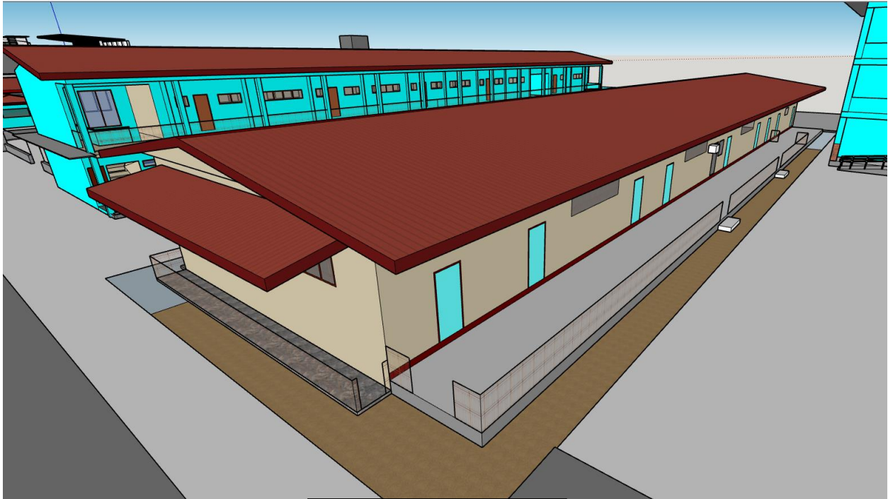
CTHM Phase 1 Existing

❖ All photocopied/ not original document should be stamped with Certified True Copy (CTC).